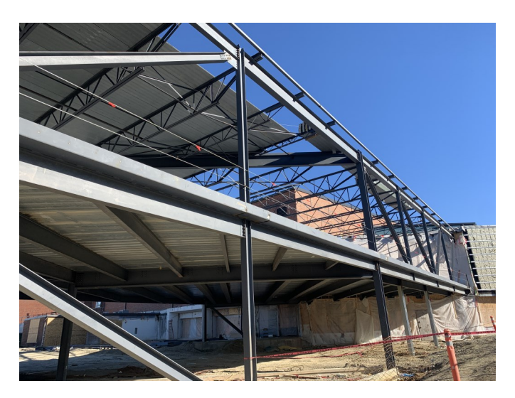
Zone C—Addition 2 North - Structural Steel