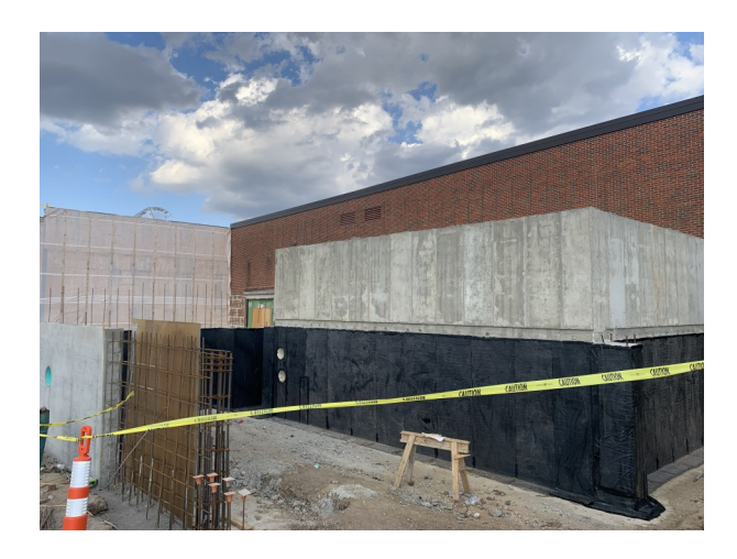
Area G—Addition 2 South—Foundation Walls