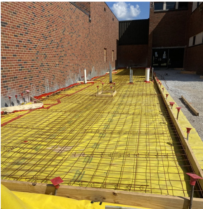
Addition—Slab on Grade Preparation