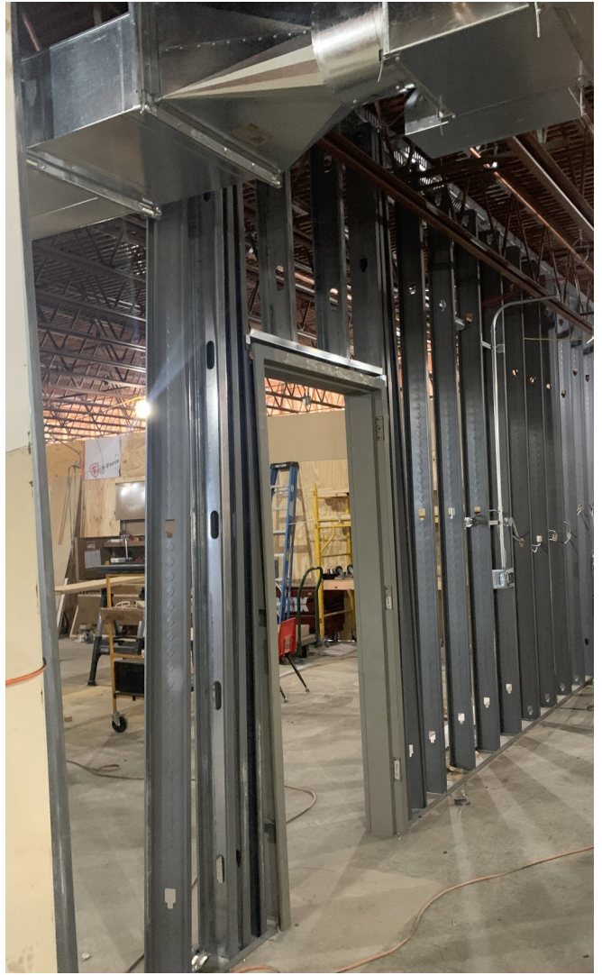
Interior Wall Framing in Science Wing