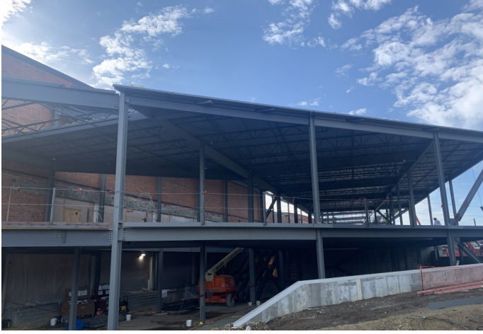
Addition—Structural Steel Framing and Decking