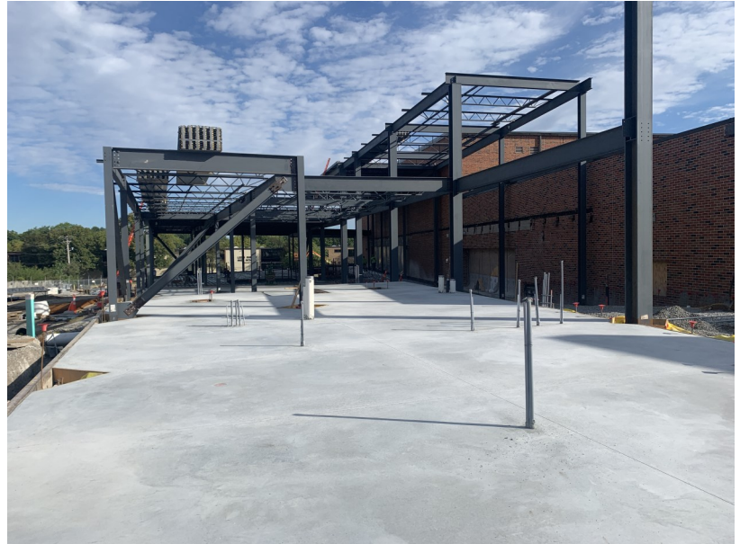
Addition— Slab on Grade and Structural Steel