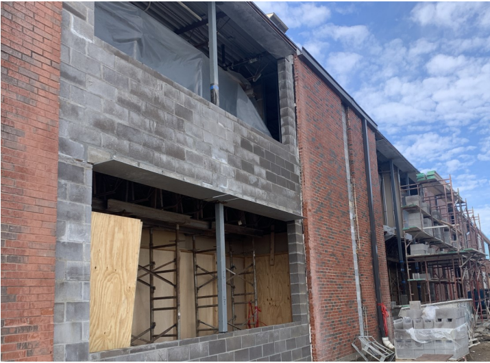
A Building—Exterior Window Openings