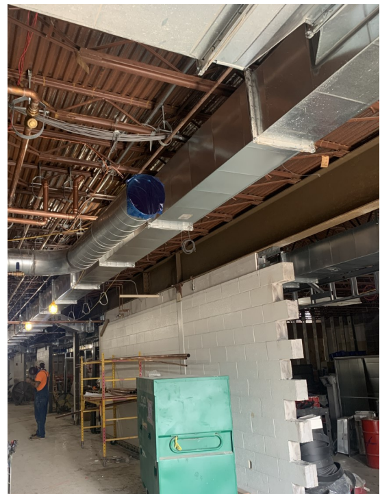
Science Wing - Overhead Mechanical, Plumbing, and Electrical Systems