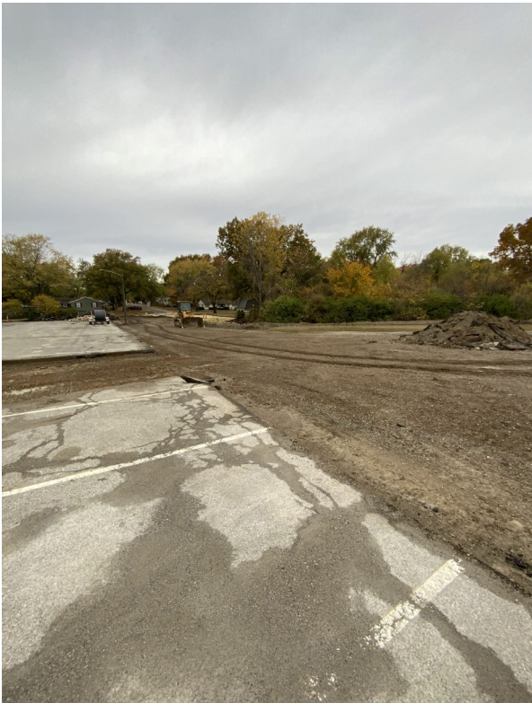
North Cage Parking Lot—Pavement Stripping