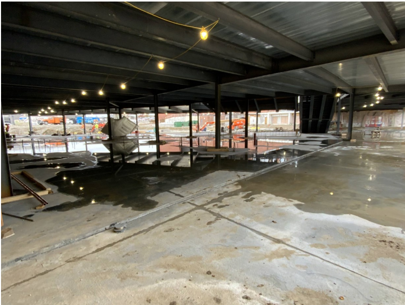
Addition 2 North—Concrete Slab on Grade