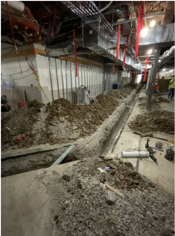
Area B Level 1—Underground Plumbing