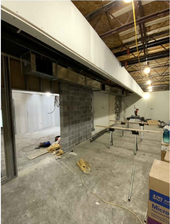
Area B Level 2 East—Classroom Framing