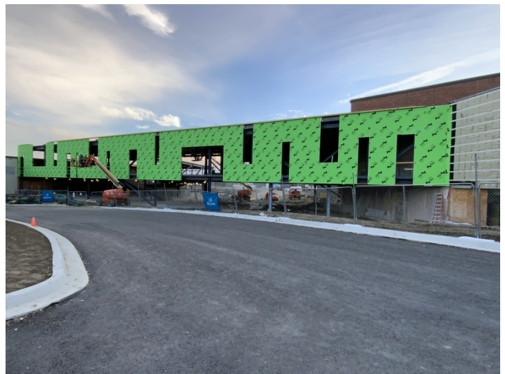
Zone C—Addition 2 North - Weather Barrier Sheathing