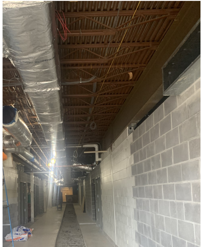
Overhead Ductwork, Underground Plumbing Trenches, and New CMU Block Walls in Lower Science Wing