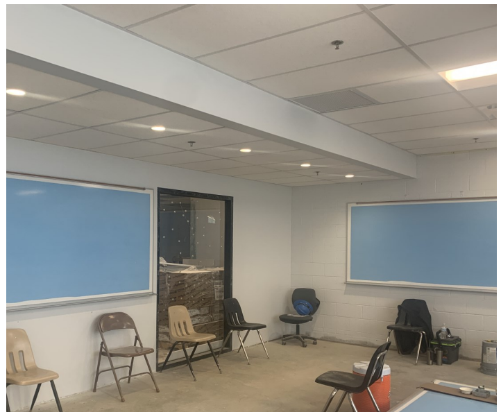
A Building—Upper Level—New Acoustical Ceiling, Lights, Markerboards, Interior Window, and Paint