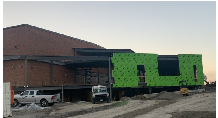
Addition— Exterior Wall Framing and Sheathing