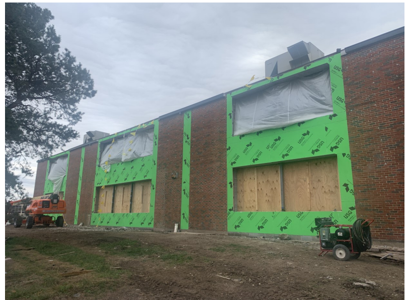
A Building North Face New Window Openings