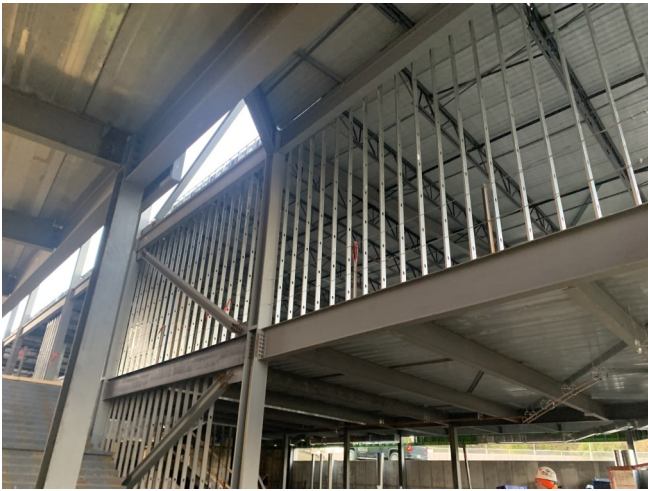
Addition—Structural Steel Framing and Interior Wall Framing