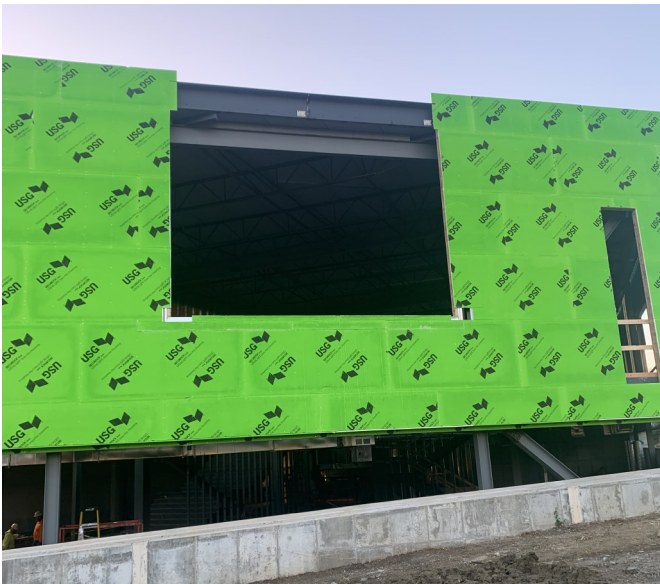
Addition—Exterior Window Openings and Sheathing