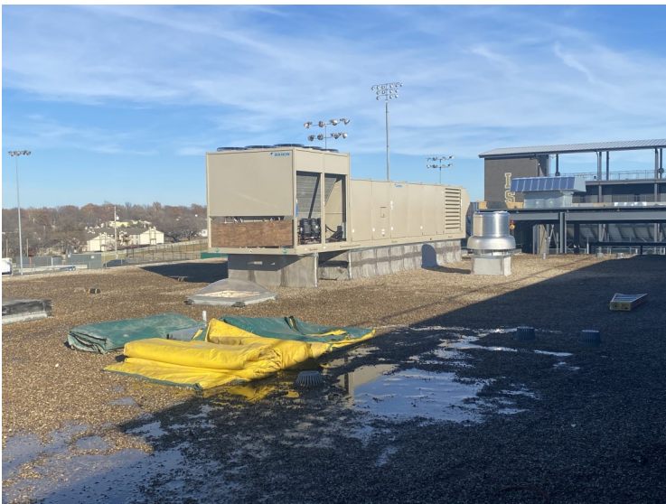
Area B Roof —RTU B9 set