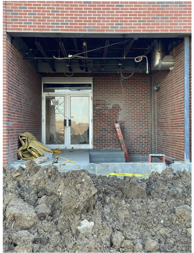
Zone J —Concrete Landing and Stairs