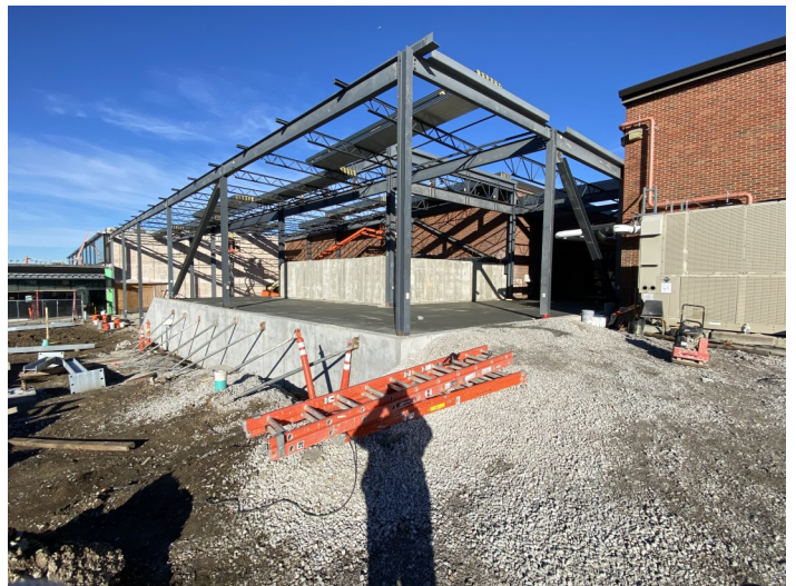
Zone G—Addition 2 South - Structural Steel Erection