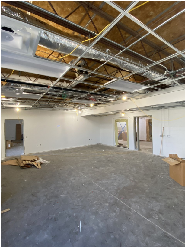
Zone B Level 2 —North Classrooms Paint and Ceiling Grid