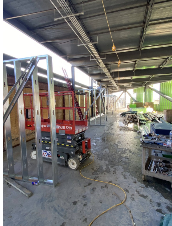
Zone C—Addition North—Metal Stud Framing