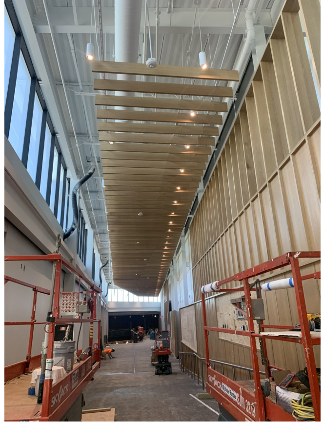
Addition—Level 2 - Wood Walls and Wood Baffles