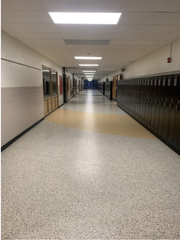
Renovation—North B Building Pre-Demolition