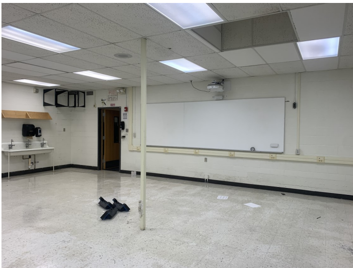
B Building North—Pre-Demolition