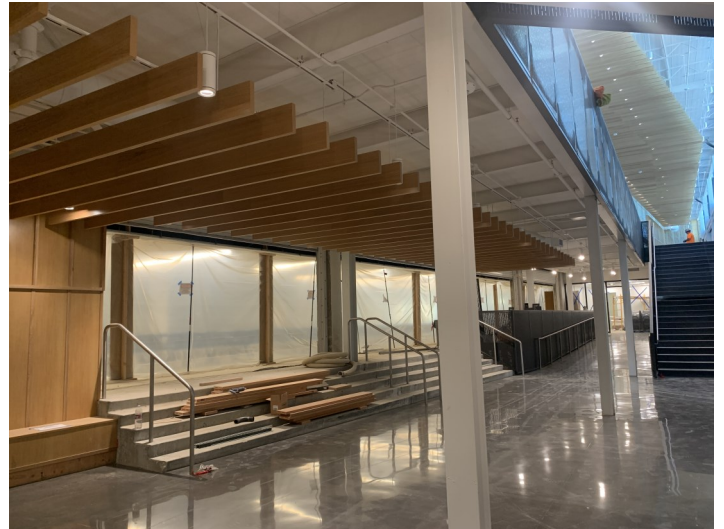
Addition— Wood Baffles in Entry Way