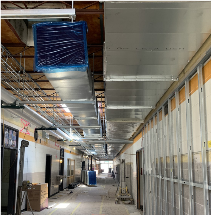
Renovation—North B Building Ductwork and Electrical