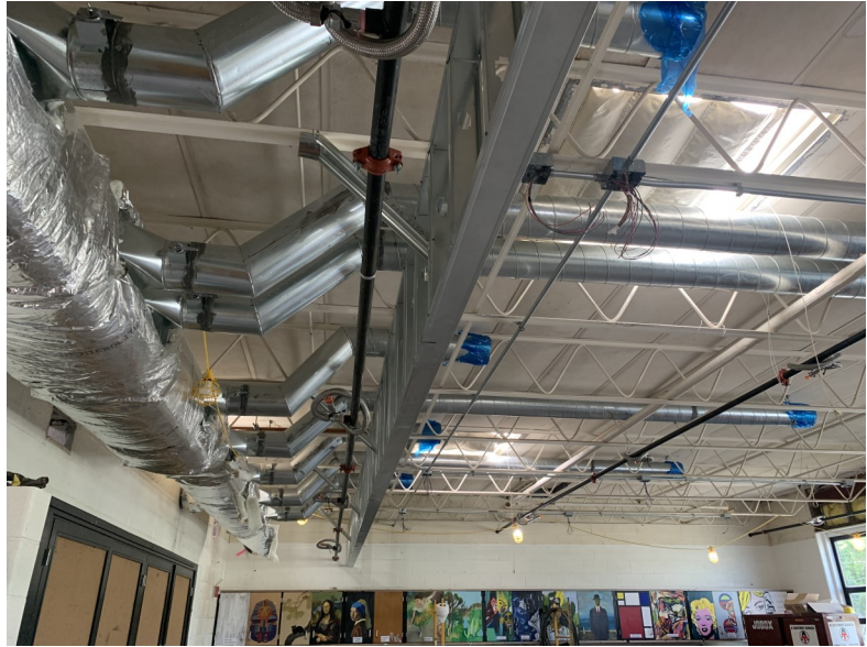
B Building North—Overhead Sprinkler and Ductwork in Art