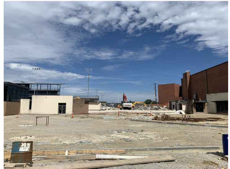
Breezeway demo for Addition 2