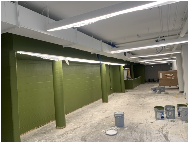
B Basement—Teacher Collaboration Space