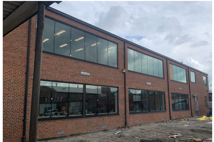
Area J Windows