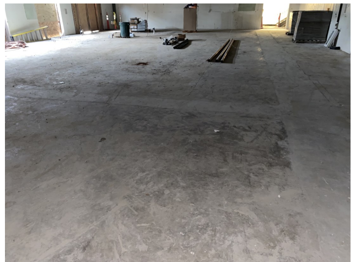
Area G Level 2—UG Plumbing install and concrete placement