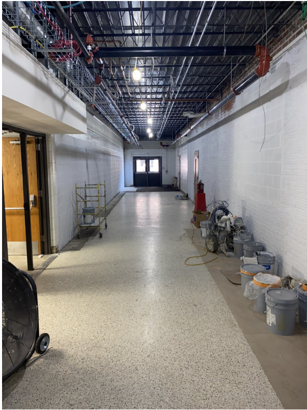
Area H Hallway—MEP Install/Brick Wall Infill