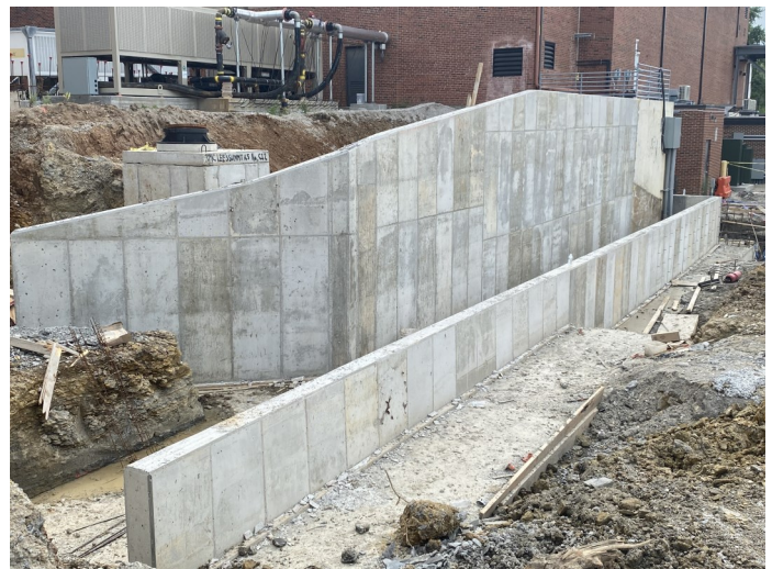
Chiller Yard Wall