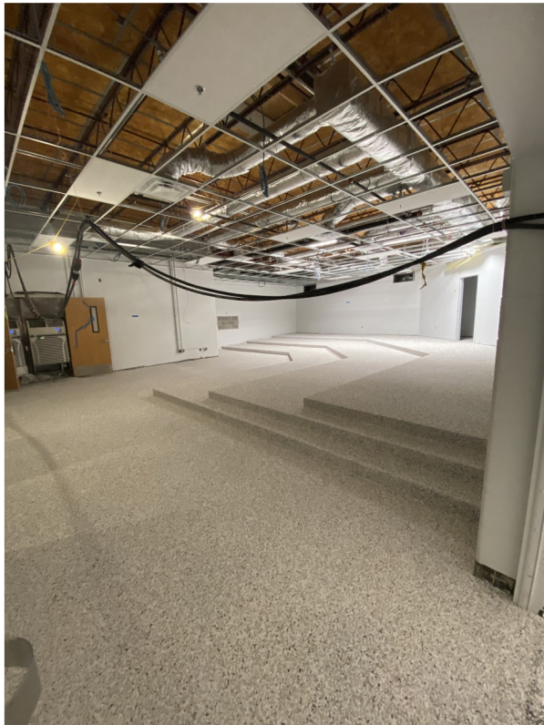
Area A/B Building Drawing Classroom