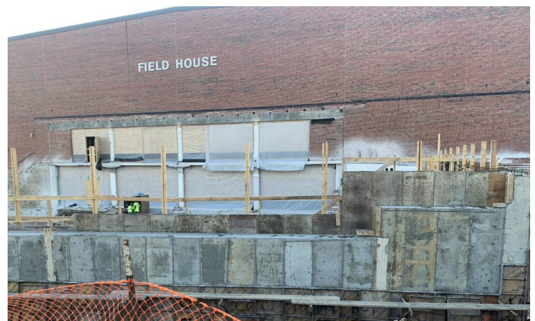
Area D Addition—Concrete Foundation Walls