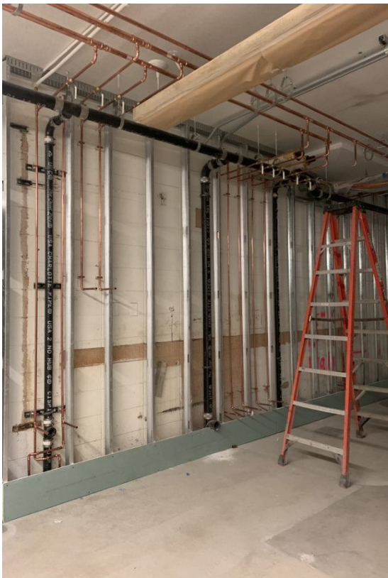
Area D - Level 1 - Kitchen Sink Wall and Overhead Plumbing Lines