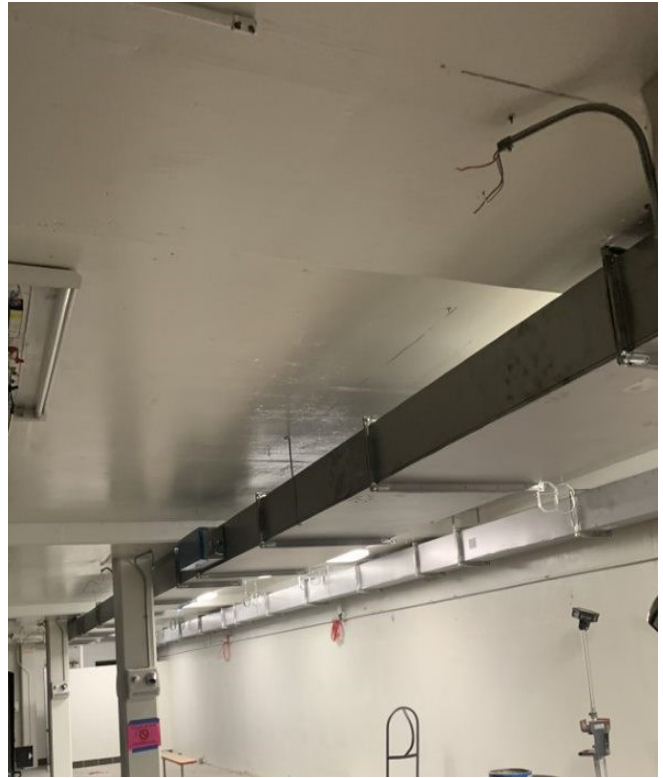
Area D- Level 2 - Girl's Locker Room– Overhead Ductwork Complete