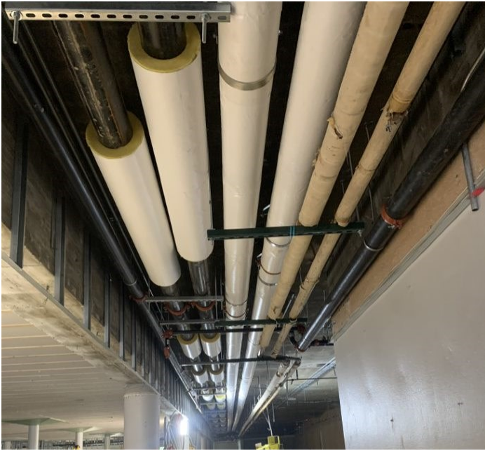
Area D - Level 1 - Cafeteria—Overhead Mechanical, Plumbing, and Electrical Lines Mostly Complete