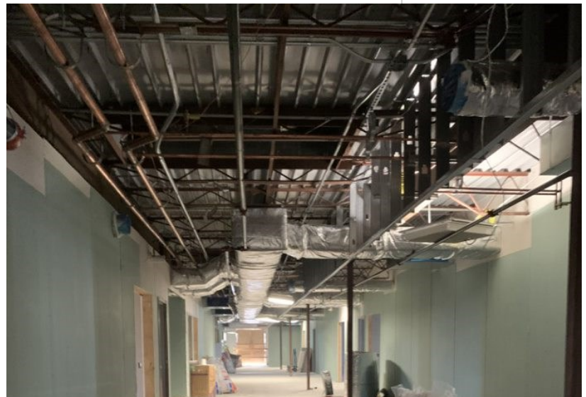
Area J –Level 3—Drywall Installed