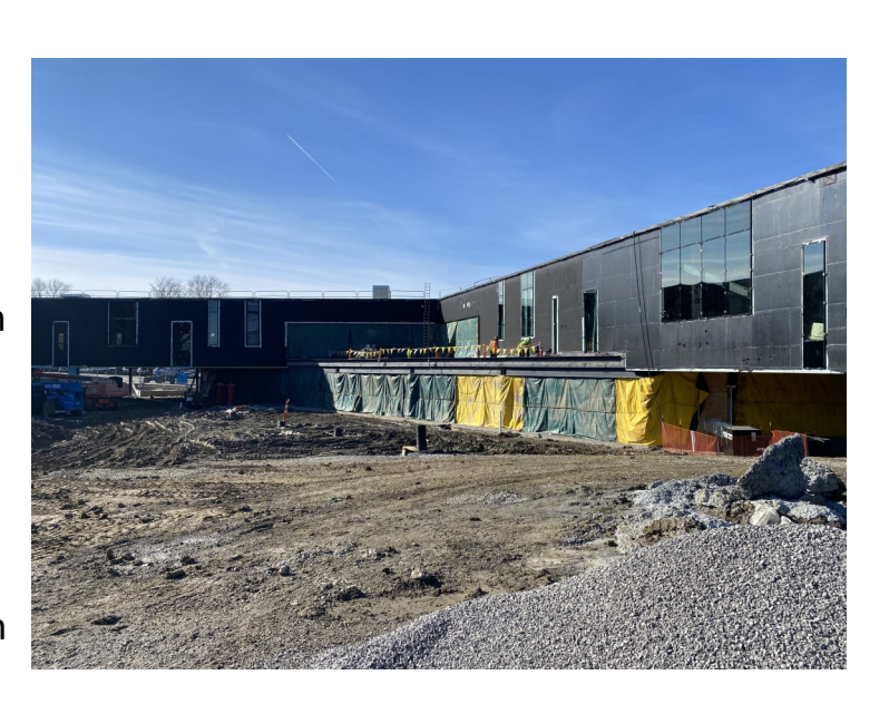
Zone C—East Elevation Skin and Glazing