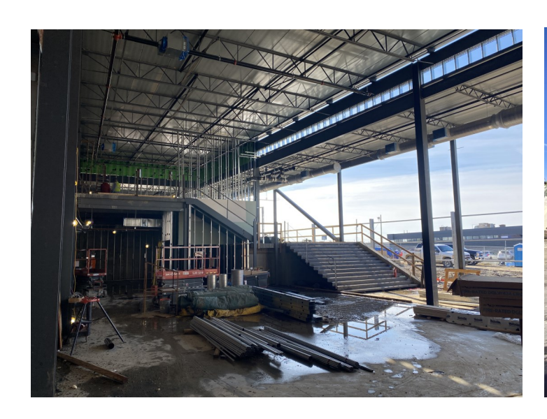
Zone G—South Addition 2 – Stud Framing and Roofing