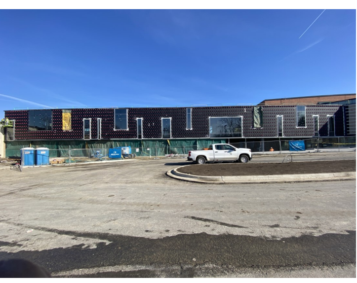
Zone C—Addition 2 North—West Side Skin and Glazing