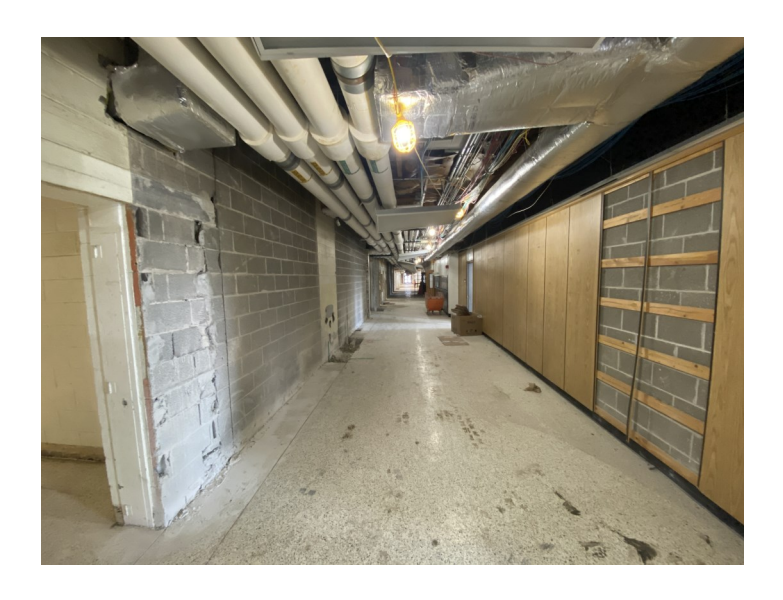
Zone K—Hallway Demolition