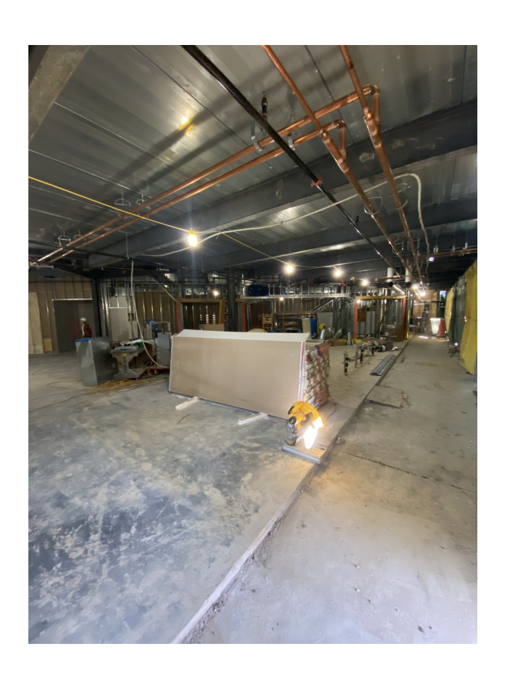
Zone C—Overhead MEP and Stud Framing