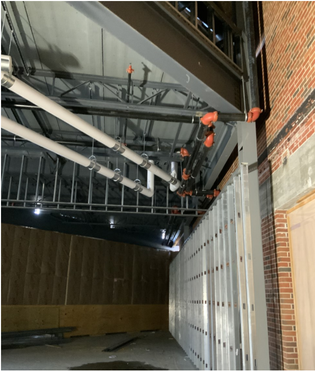
Addition— Level 2—Wood Wall Backup Framing and Overhead Sprinkler and Plumbing Systems