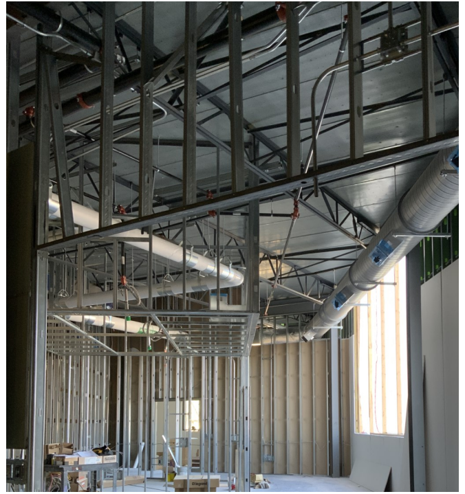
Addition—Level 2 - Wall Framing and Overhead MEP Systems