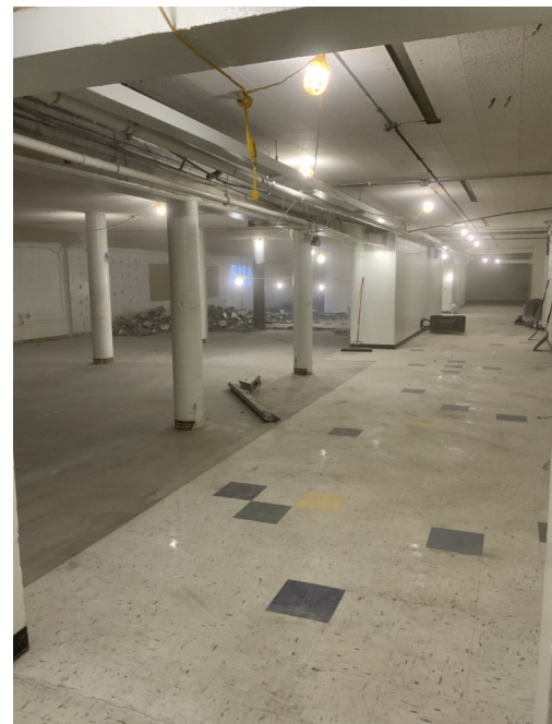
B Building—Demolition of CMU walls, Ceilings, and Overhead MEP Systems