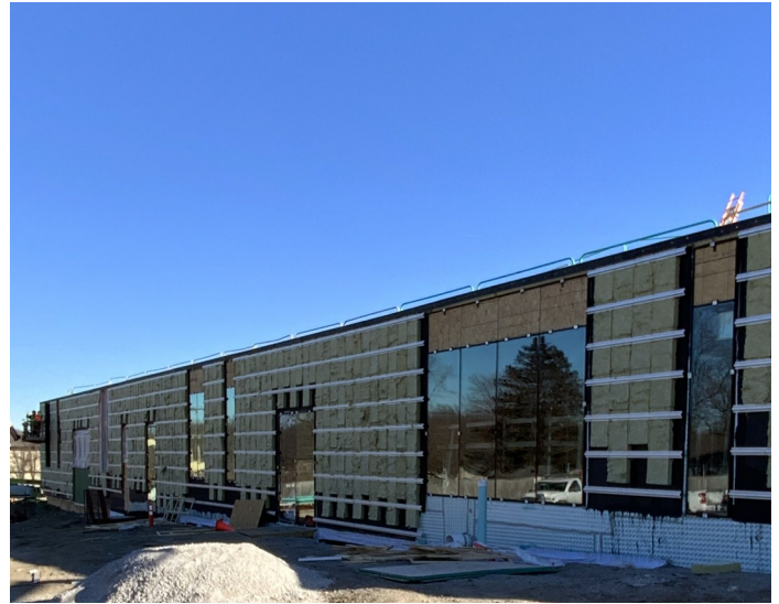
Addition— Exterior Windows, Metal Panel Clip System, and Insulation Installation