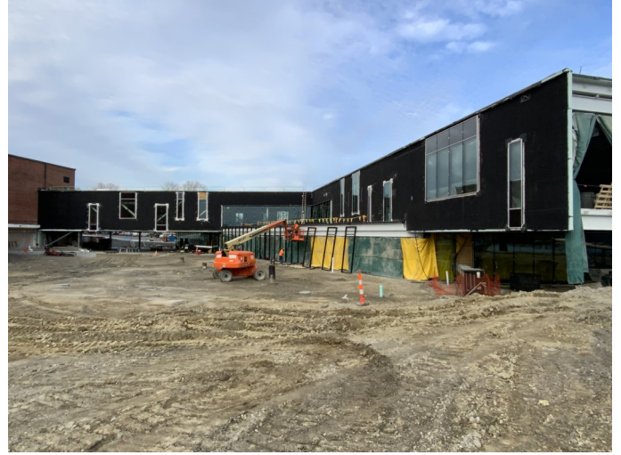
Zone C—Storefront and Skin in Progress