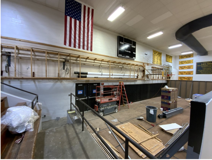
Zone K—South Gym MEP work In Progress