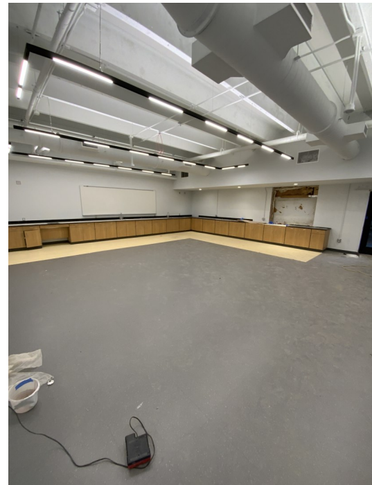
Zone G—Flooring and Finishes Installed