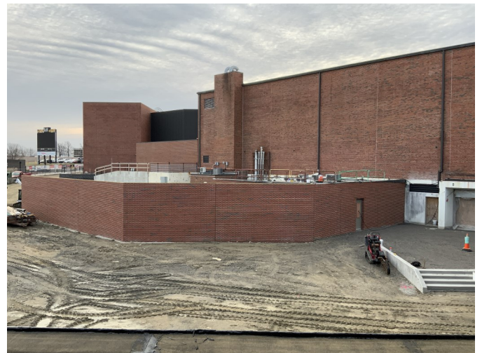
Loading Dock Brick Wall