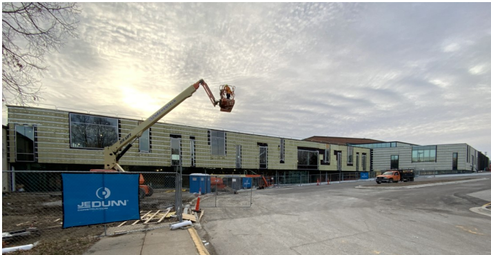
Zone C—North Addition Insulation and Channel for Metal Panels