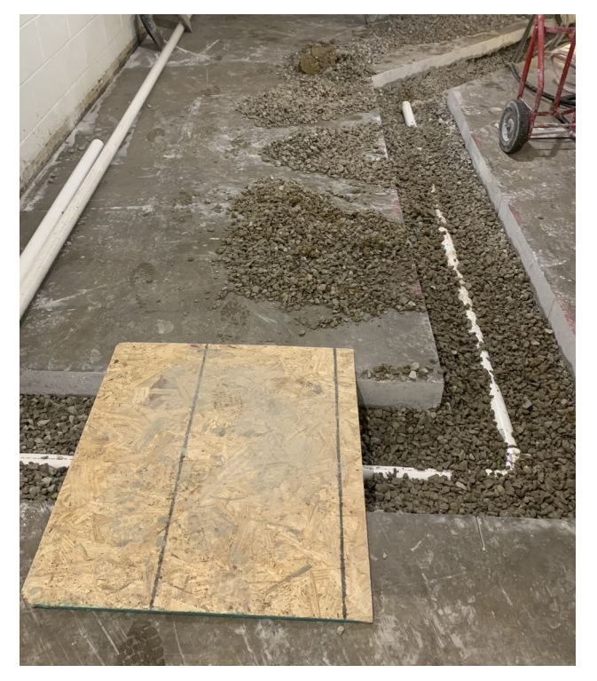
B Building Basement—Start of underground plumbing and trenching