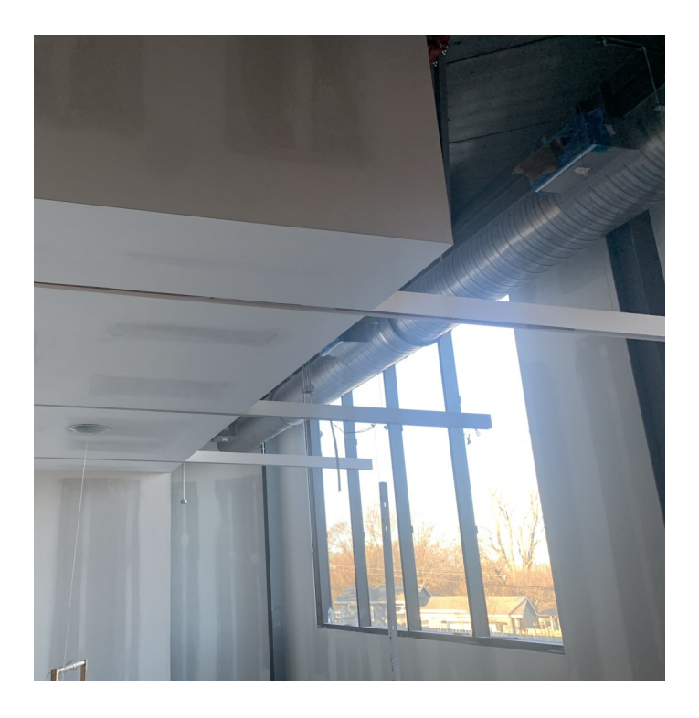
Addition—Level 2 - New linear light fixtures and window at administration area