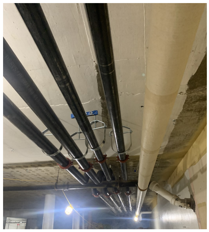
B Building Basement—Overhead Mechanical Piping