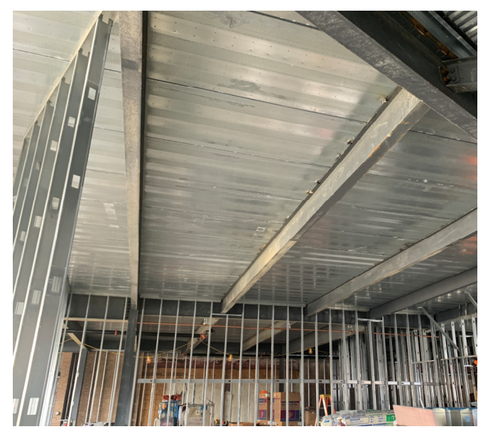
Zone C—Level 1—Interior Framing in Progress