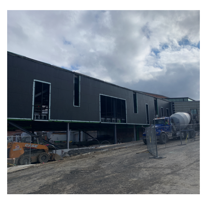
Zone C—Addition 2 North—West Side Skin