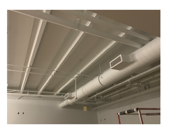
Zone G—Renovation—Permanent Ductwork and Direct Applied Ceiling