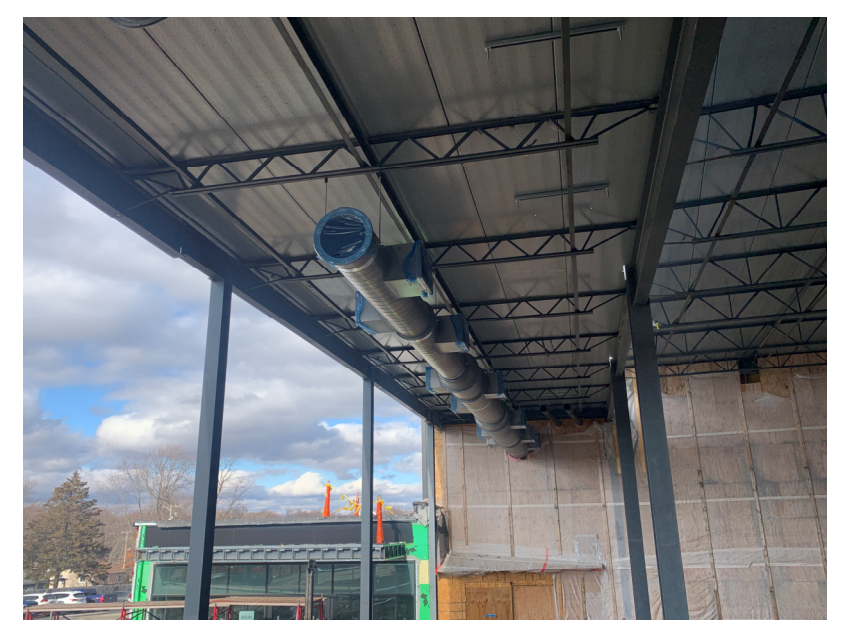
Zone G—South Addition 2 – Steel Complete and Overhead In Progress