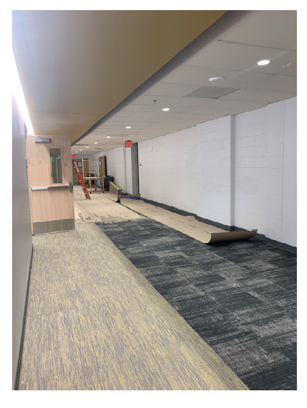
Zone B—Complete Hallway in Level 1