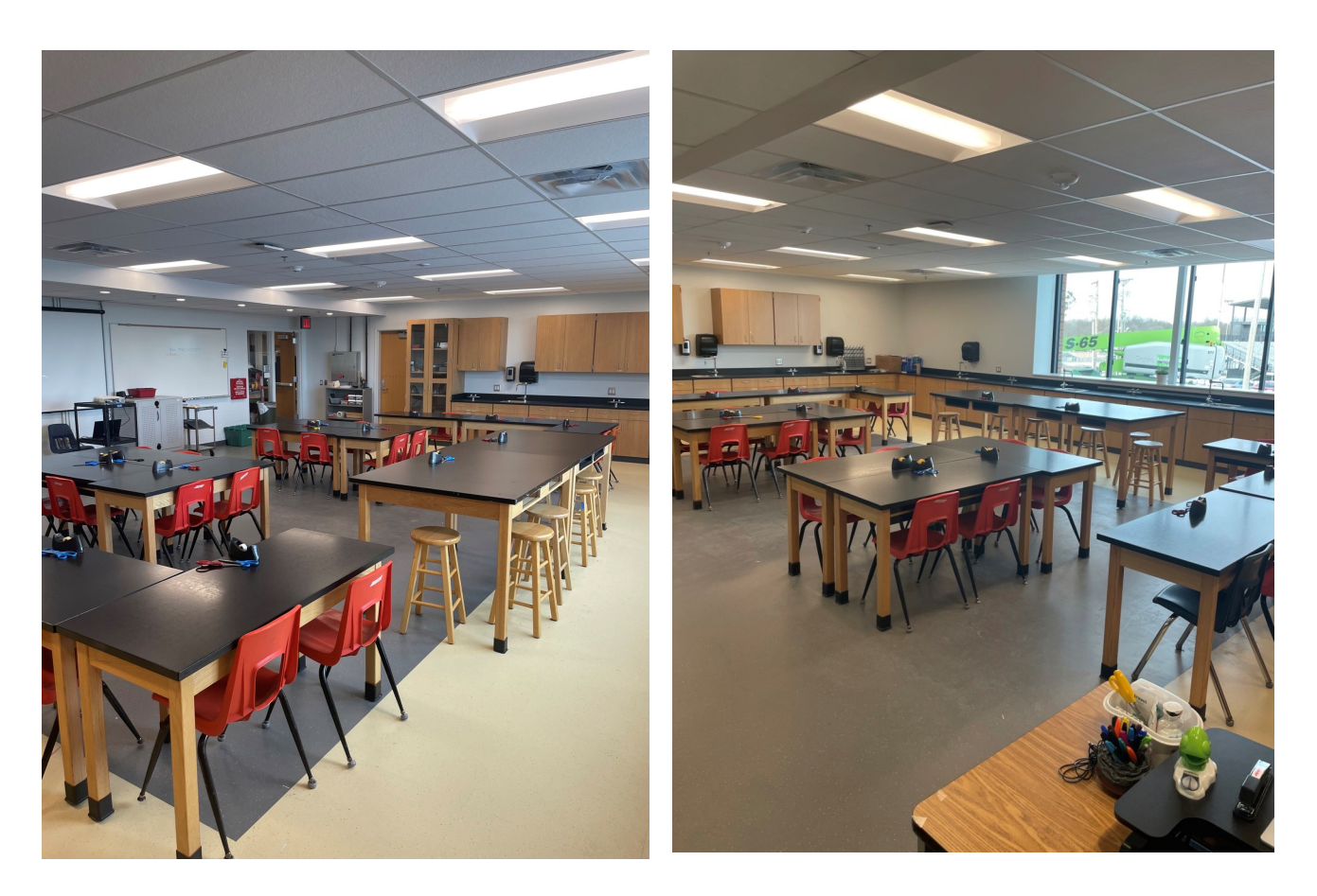
A Building Science Wing—New Flooring, Paint, Lighting, Science Casework and Countertops