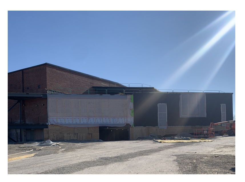
Addition— Exterior Air Barrier and Temporary Enclosures