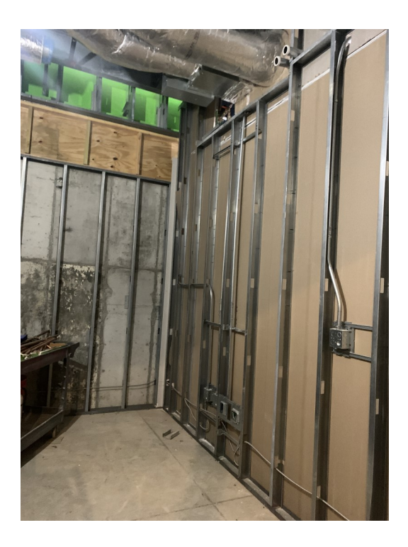
Addition—Level 1 Interior Wall Framing and Drywall