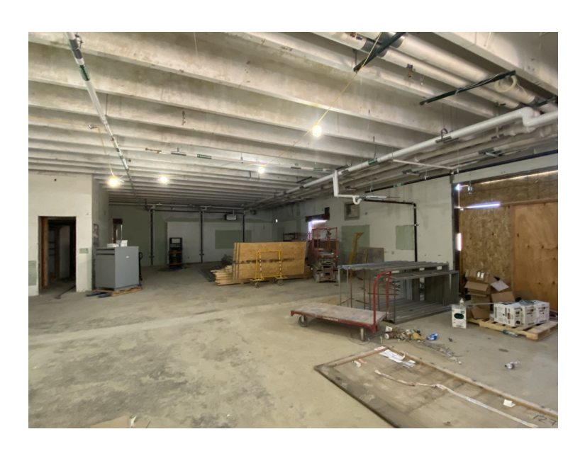
Area G Level 2—MEP Demo