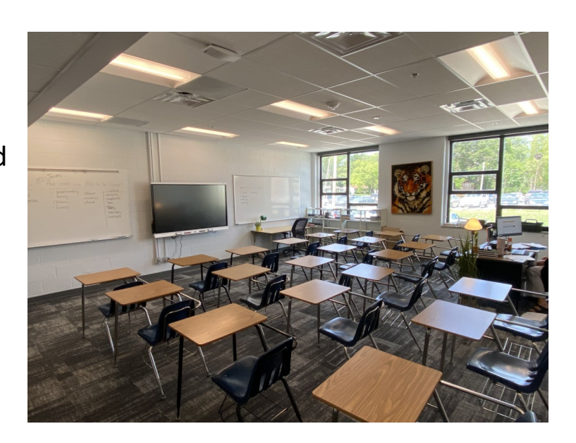
Area A/B - Finished Classroom