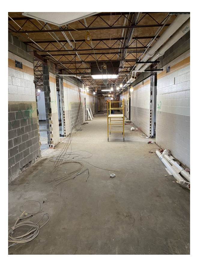
Area G - Building Pad Area B East—Demolition