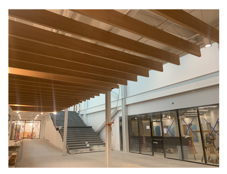
Addition- Wood Baffles in Entry Way