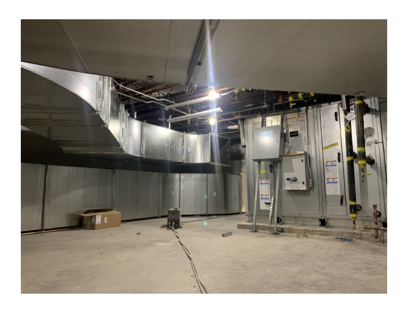
B Basement—New Mechanical Unit and Ductwork