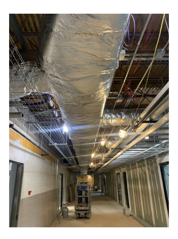
B Level 1 West—Hallway Overhead Work in Ceiling