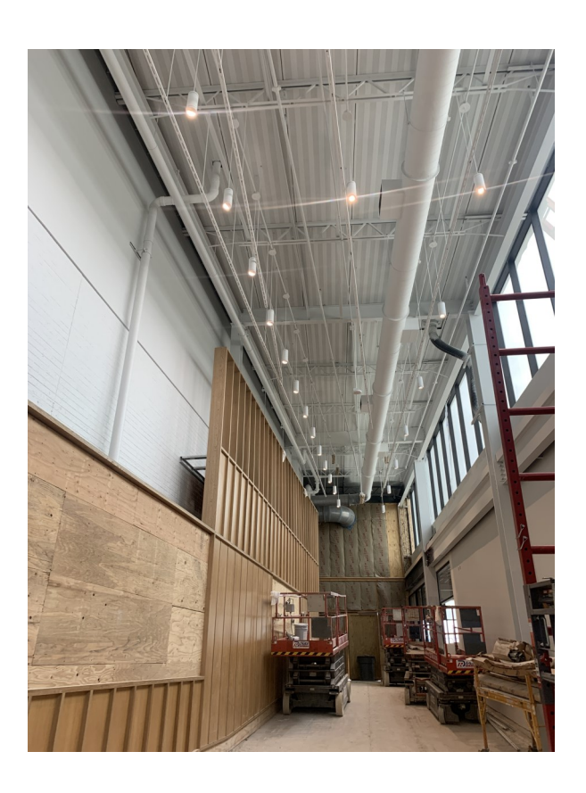
Addition—Level 2 - Wood Wall Installation in Progress